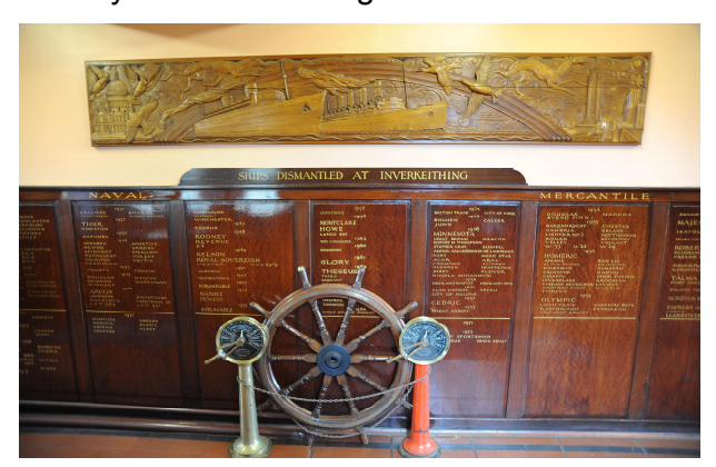
The photograph of the Roll of Honour at the former

On the east side of the peninsula there is a different story to record. Inverkeithing Bay was home for the shipbreaking company T W Ward which specialised in dismantling a wide cross section of ships making up our maritime heritage. From the 1920's onwards many of our great ships entered the Forth to end their days at Inverkeithing.