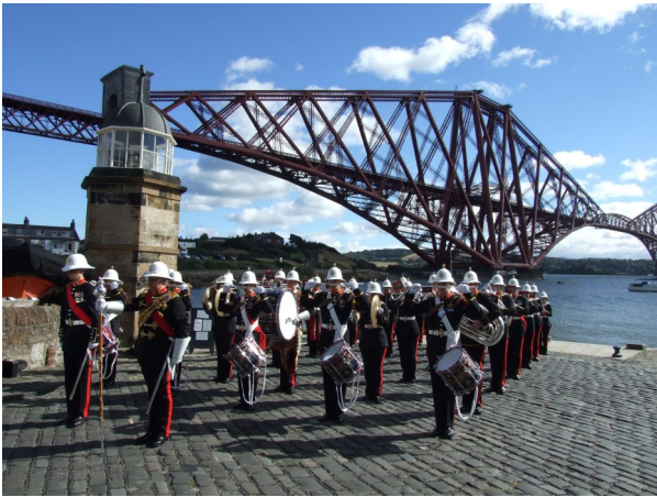
Band of the Royal Marines at the Town Pier

come, enjoy their experience of whatever North Queensferry has to offer. The Forth bridges area will be very much under the spotlight over the next few years as changes start to take shape and the towers of the Queensferry Crossing start to appear above water.