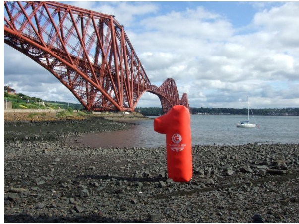
Buoy advertising the Commonwealth Games 2014