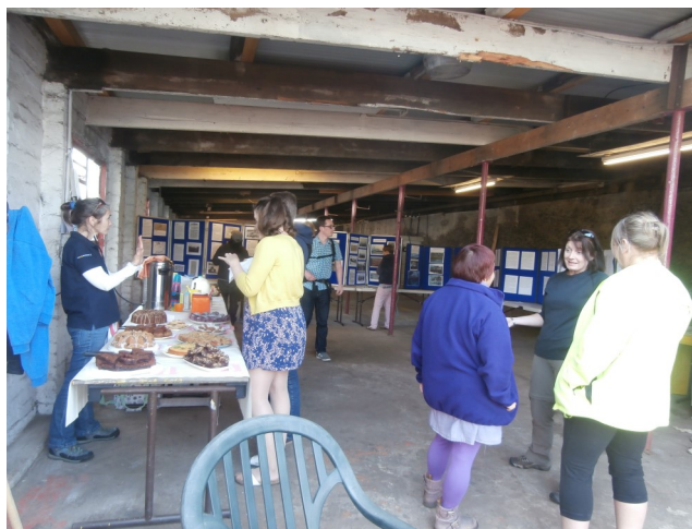
'Food for thought - feeding ideas for the marina's future'

For more details and trust membership please contact nq.community.trust@gmail.com