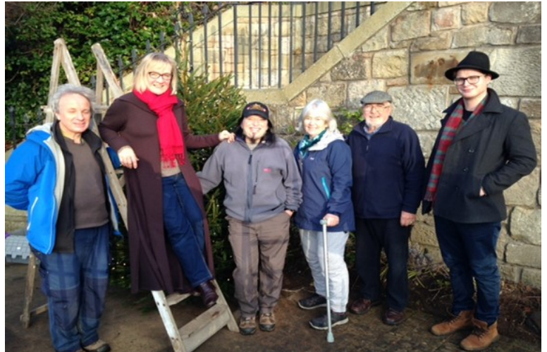
Putting up the Christmas tree: members of the community council and a Slovak friend

The next meeting of your community council is Thursday 9 February in the Community Centre at 7.30pm.