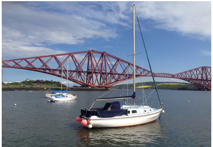
West Bay Moorings

or pop down to the club at the weekend for a blether and a cuppa!