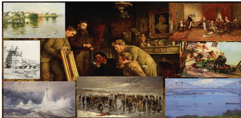
All sketches and paintings on display are copies of the originals which the Trust gratefully acknowledges their contribution to the exhibition.

We are grateful to The Royal Collection Trust, National galleries of Scotland, Abbotsford Trust, Cuneo Estate, Imperial War Museum, Science & Society Picture Library, Fine Arts Museum of San Francisco, Trustees of the Tate, Rijksmuseum Amsterdam, Irvine Burns Club, The Royal Caledonian Curling Club & our local anonymous donor.